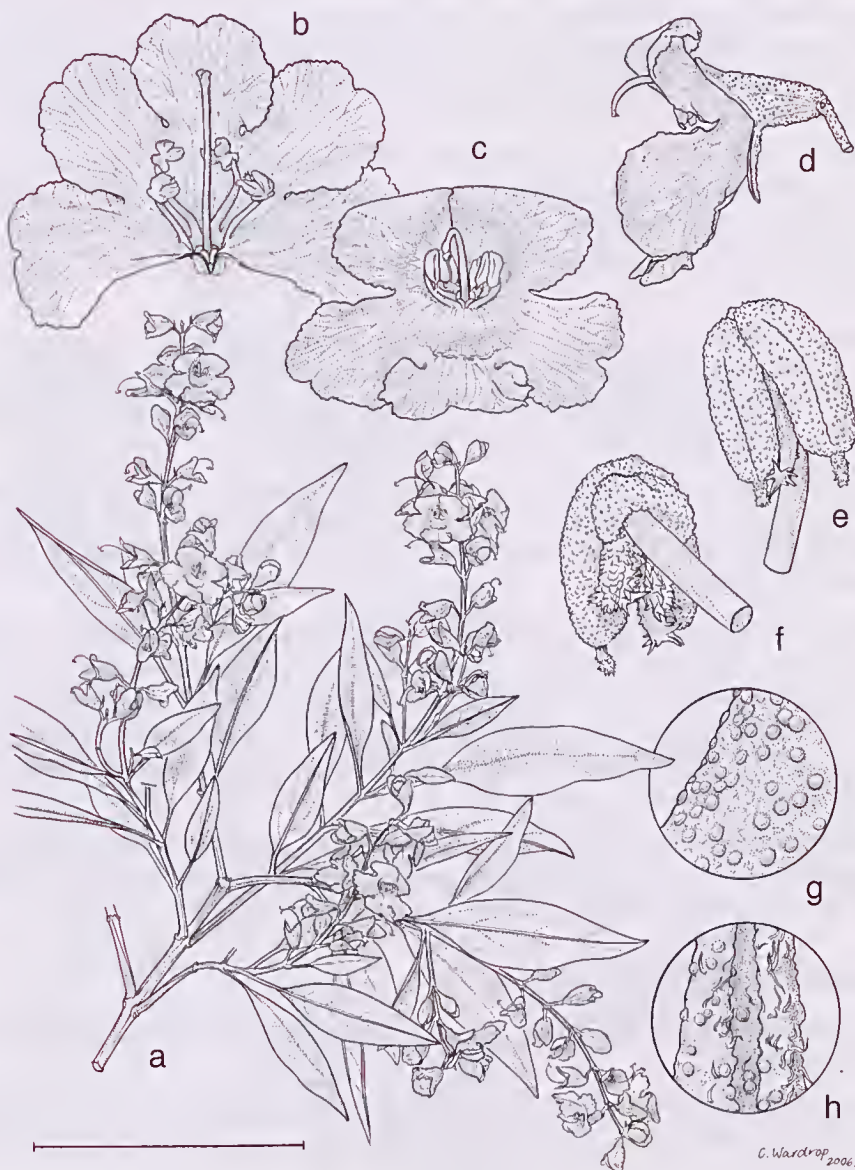
Fig. 1. Prostanthera petraea a, branchlets showing leaves, flowers and developing fruits; b, flower (ventral view), with adaxial lobe-pair dissected to show androecium and gynoecium; c, flower (ventral view) showing corolla, androecium and gynoecium; d, flower (side view) showing calyx, corolla, style and stigma; e, stamen (ventral view) showing connective and anther appendages; f, stamen (dorsal view) showing connective and anther appendages; g, detail of adaxial surface of leaf showing hemispherical glands; h, detail abaxial surface of petiole showing hairs and hemispherical glands (a–g from Conn 3670 & Brown; h from Conn 3668 & Brown; both NSW). Scale bar: a=55 mm, b–d=15 mm; e & f=3 mm; g & h=20 mm. Illustration by Catherine Wardrop.